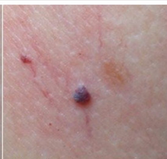
After 1 IPL treatment