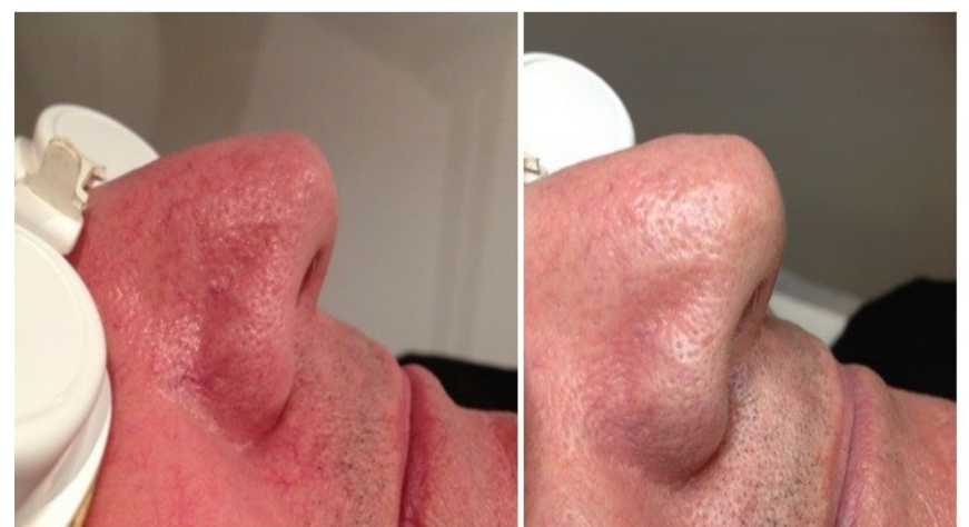
telangiectasia around nose - before & immediately after 1 IPL treatment