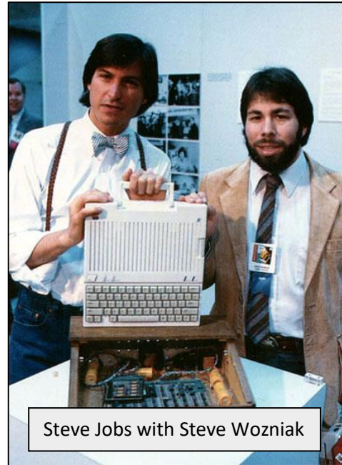
Steve Jobs with Steve Wozniak

IPL Photo rejuvenation works incredibly well for rosacea and is usually the treatment of choice amongst most of our patients.