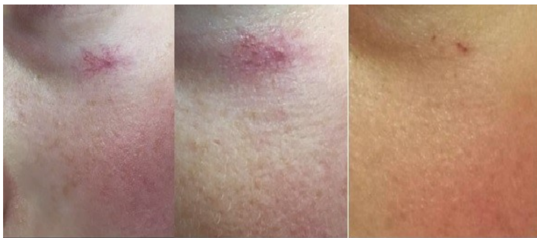
spider vein before right after 1 IPL treatment 2wks later