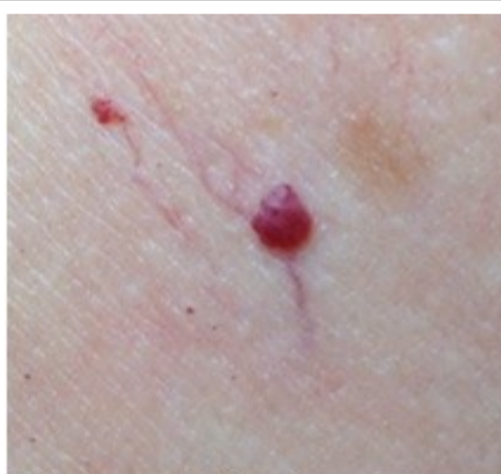
Before IPL treatment

MAINTENANCE PLAN: once every 8-12 months for continued stimulus to collagen/elastin. Skin care greatly enhance results