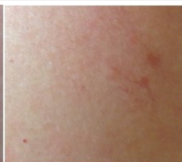
2 wks after 1 IPL treatment